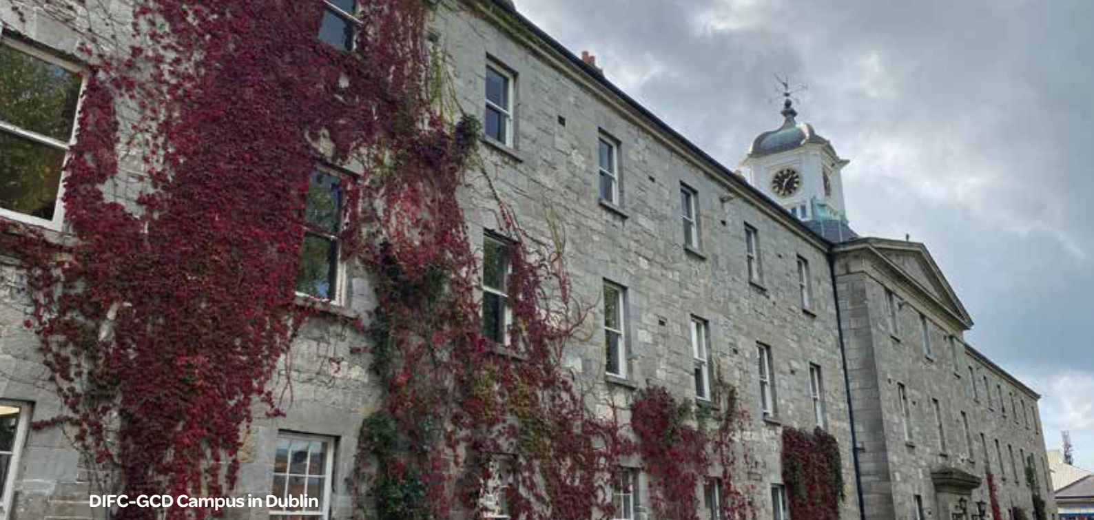
DIFC-GCD Campus in Dublin